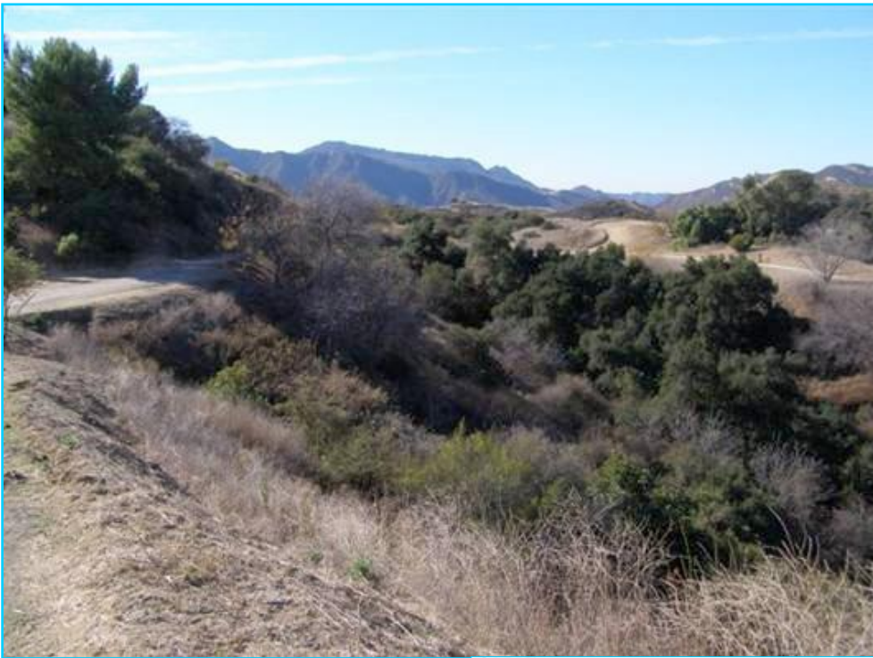
The new 101-acre parkland, which is accessible from Old Topanga Road, bolsters public ownership of existing trail networks in Topanga Canyon near the Santa Monica Mountains Conservancy-owned Summit Valley Ed Edelman Park.